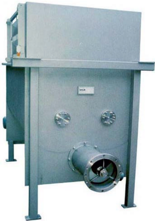
Image of variant 1 Machine version with transport spiral TYPE BPDM 2 WU - AS